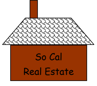
Make the right move

Note : Your text may look slightly different depending on the font you choose.